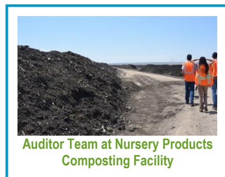
Auditor Team at Nursery Products Composting Facility