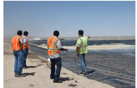
Auditor Team at Nursery Products Composting Facility