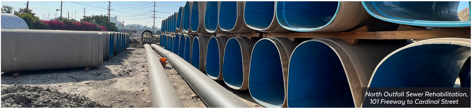
North Outfall Sewer Rehabilitation, 101 Freeway to Cardinal Street