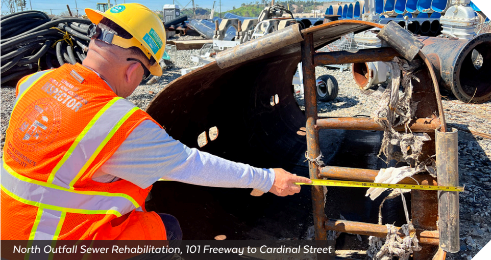
North Outfall Sewer Rehabilitation, 101 Freeway to Cardinal Street