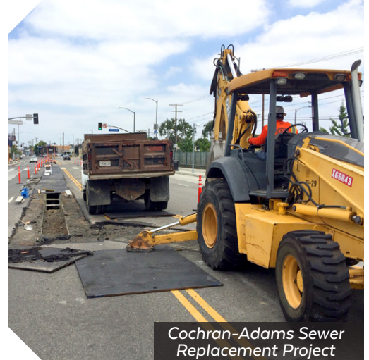
Cochran-Adams Sewer Replacement Project