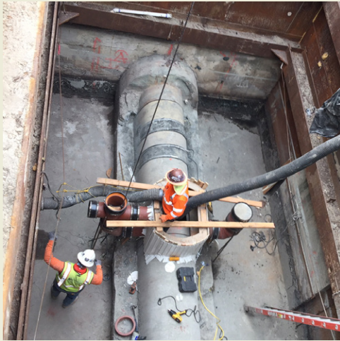
North Outfall Sewer Rehabilitation